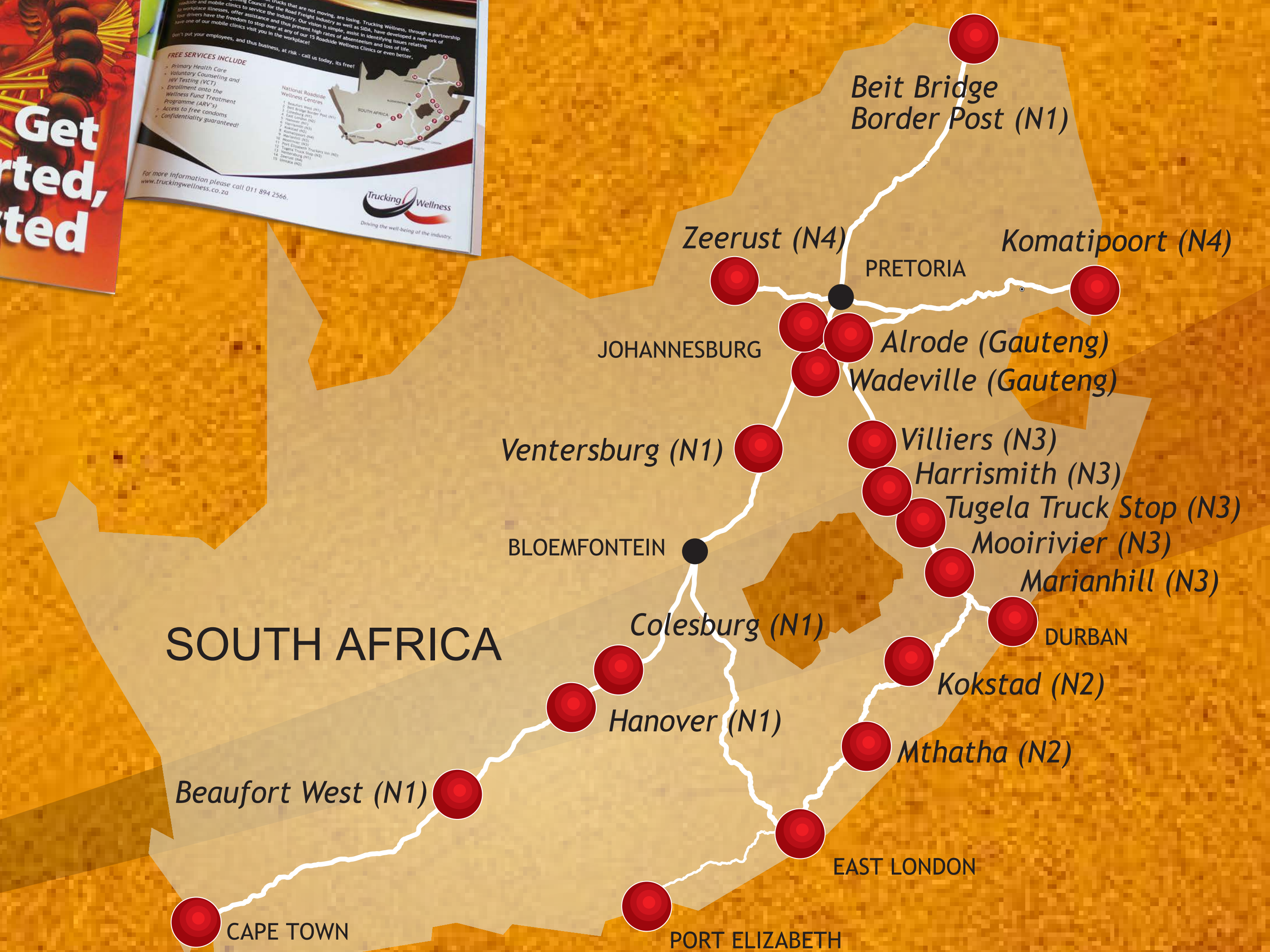
Wellness Centre Sites as of 2010