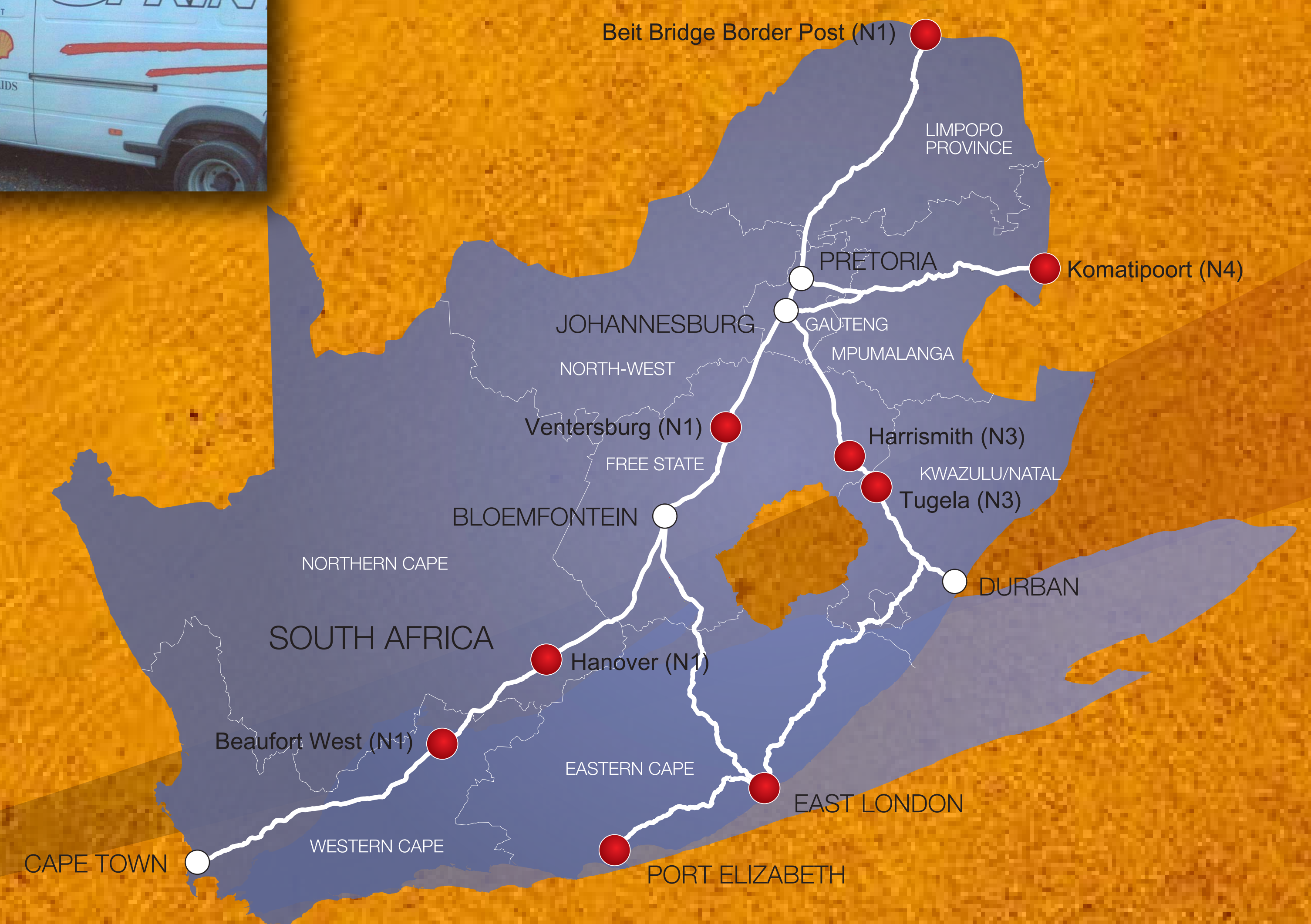
Wellness Centre Sites as of 2003