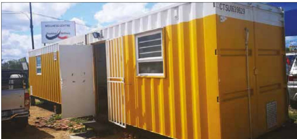
▲ Beitbridge/Musina Wellness Centre – the busiest border post in Southern Africa with thousands of trucks and drivers passing through daily.

As we continued to investigate, we discovered huge obstacles to advancement – the biggest being the lack of urgency spurred on by ignorance. We also found