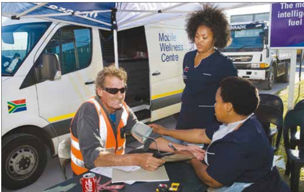
▲ Trucking Mobile Wellness Day held at Swartkops, Tshwane.

With all this in place – here comes the real punch. Since its launch in 1999 up to September 2019, Trucking Wellness has provided healthcare education to 838 055 long distance truck drivers, sex workers and community members. 487 068 patients have been consulted and have received various forms of treatment and care and some 23,5-million condoms have been distributed to these key population groups. Additionally, 83 196 individuals have received ▶ 40