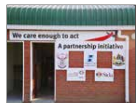
▲ Mooi River (N3)