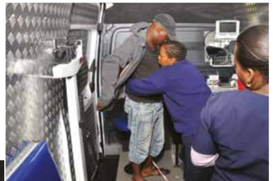
May 2012 – Trucking Wellness in action together with sponsor Engen on the N3 at Harrismith.

Another meeting later followed where it was decided now that the initiative was up and running, it be handed over to the Road Freight Association to work in conjunction with the Minister of Transport and the Department of Transport in taking it forward. I must note that not much was done for a while but then, in 1999, a major announcement was made. ▶ 38