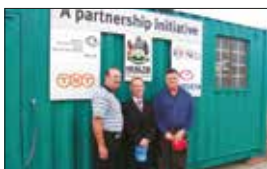
▲ Kokstad Wellness Centre