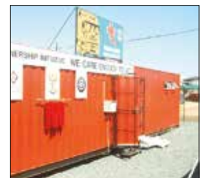
▲ Komatipoort (N4)