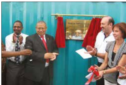
▲ The Colesburg Wellness Centre is established on the N1.

of their drivers dying from AIDS – and they were lost as to what to do about it. The trucking industry would have to mobilise its own resources behind some initiative that would target truck drivers - and the industry at large – in a concentrated effort outside of the National Aids Plan (NAP) and outside any other initiatives.