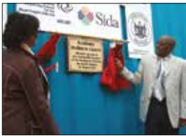
▲ Zeerust launch