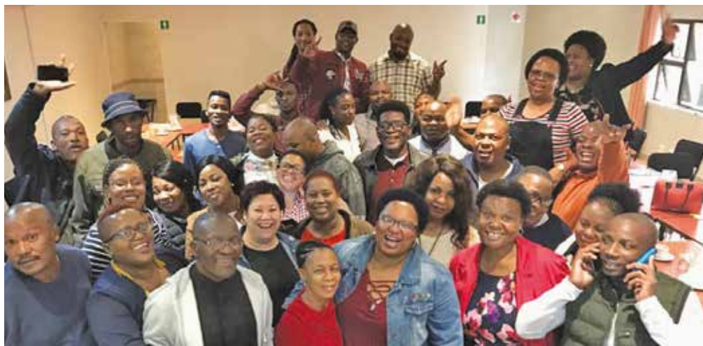
▲ The Trucking Wellness Programme Roadside Clinics team – Celebrating 20 years!